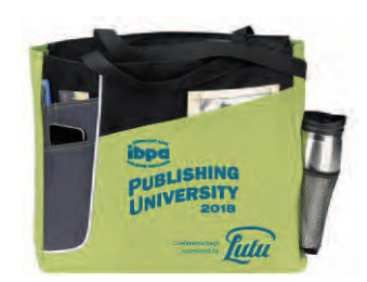
The 2018 conference tote bag

Exclusive sponsorship of the conference tote bag. Your company logo will be placed on the conference tote bag given to all program registrants, in-person and virtual. Your logo (single color) is placed alongside the IBPA Publishing University logo.